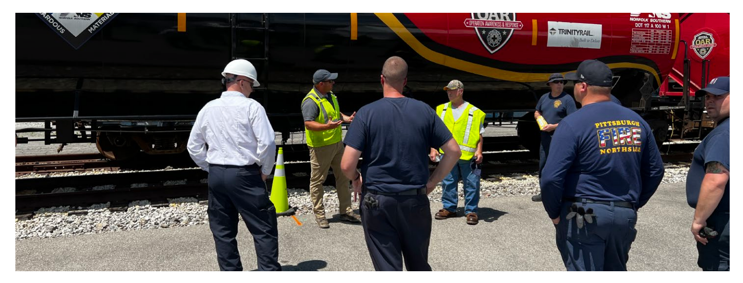
Above: Norfolk Southern sought out ANS to conduct an independent review of the company's safety policies and have already taken actionable steps to retrofit policies and procedures.

While we are proud of the progress we've made in the last year, we have many more initiatives underway throughout 2024. Additionally, as part of the ANS-supported safety roadmap mentioned previously, we plan on meeting with our labor leaders again this year to get insight into their experiences and to further refine our safety programs. We look forward to continuing our strong relationship with our craft employees as we demonstrate our collective commitment to safety.