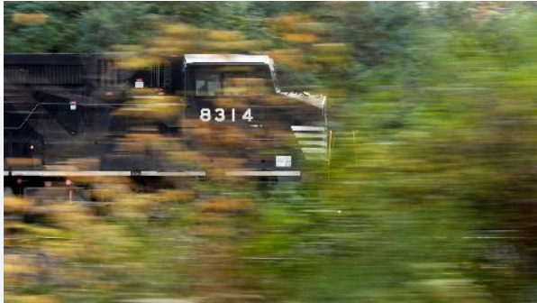
Train Speed (mph)